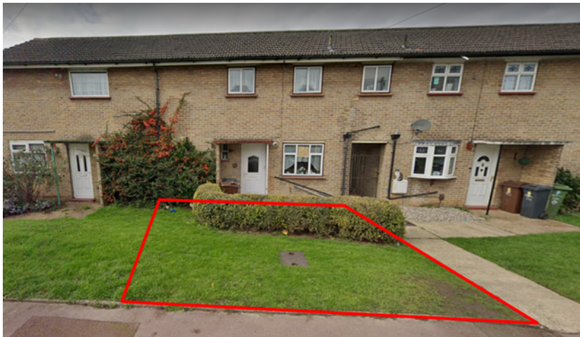
Plan and Photo of land fronting 10 Calverley Crescent, Dagenham